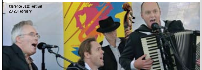
Clarence Jazz Festival 23-28 February