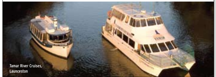
Tamar River Cruises, Launceston